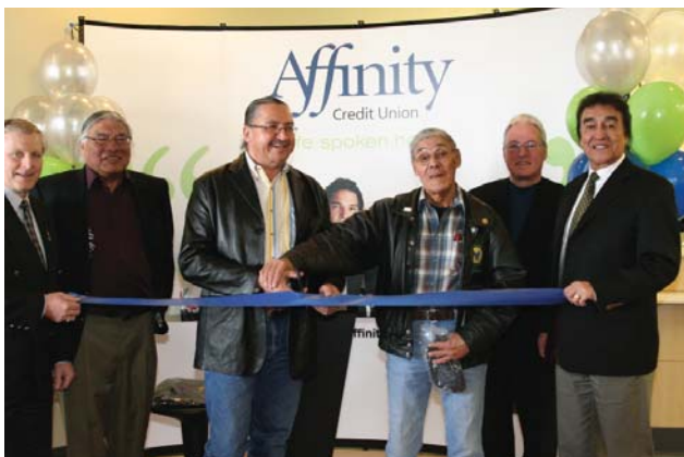
Ribbon Cutting Ceremony at Cowessess First Nation - Affinity Credit Union Branch