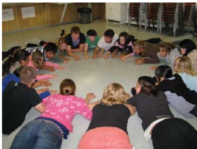
SCYP Youth Seminar in 2008

The Senior Grad level is open to those who have recently completed Grad and can't get enough Co-op Camp! This seminar will not only provide participants with a chance to see old friends, but it will also take all the knowledge and skills learned at past seminars and take it to the next level! They will be challenged to take more of a leadership role and responsibility for making the seminar a success. There will