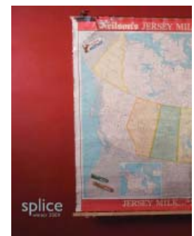
Recent covers of Splice magazine, which is published by Saskatchewan Filmpool Co-operative