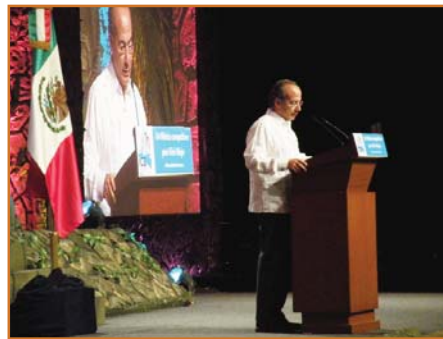
Mexican president Felipe Calderón addresses the assembly

More than 2,000 co-operators attended the week's events, which ended on the evening of Friday, November 18 with a gala dinner. They came from 78 countries and from every conceivable type of co-operative.