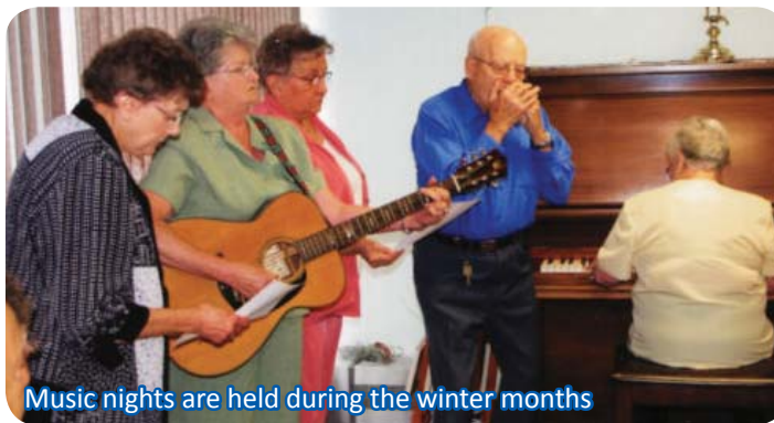
Music nights are held during the winter months

Meeting the needs of our senior citizens has not been adequately addressed by governments. It comes up at Co-operative Housing Association of Saskatchewan meetings, and while I am not sure we at CHAS have a good answer as to how to meet that need, it is being worked on.