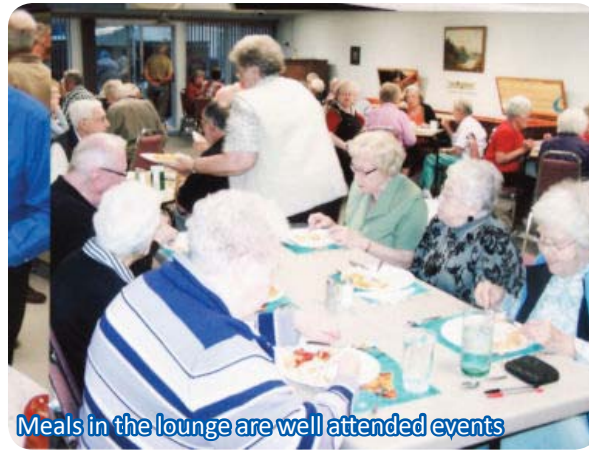
Meals in the lounge are well attended events

Lakewood Manor in particular owes a lot to CHAS, since it seemed that at every step there were roadblocks that without their help would in all likelihood have resulted in failure. Originally, the funding and all administration came from CMHC, but since the middle to late 90's the federal government unloaded co-op housing to most of the provinces, at which time the Saskatchewan Government started administration through the Saskatchewan Housing Corporation (SHC). CMHC still provides the funding which is now distributed by SHC according to our housing agreement. This funding was designed to provide affordable housing by doing two things: first, provide mortgage assistance throughout the life of the mortgage with CMHC; and second, to provide rent geared to income assistance for those with an income below a certain level. There are not enough units allotted to this, in my opinion, at least not for seniors. It is said that it is the seniors that have the money in our part of the country. That may be so but there are a lot of seniors that are also struggling financially here in Saskatchewan.